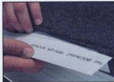
Photo 4: It's time to install your Drip Edge. Mounting instructions are explained on the following page.