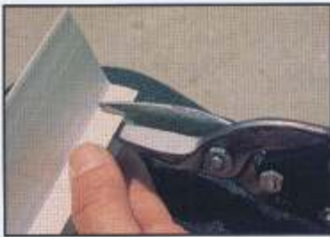
Photo 1: Using a pair of tin snips, remove a 2" piece of the downward flange from the end of the top piece of Drip Edge to be overlapped.

Because vinyl expands with changes in temperature, it is important that installed vinyl drip edge is free to move longitudinally. Preparing the overlapping ends of the drip edge as shown will insure freedom of movement and prevent distortion.