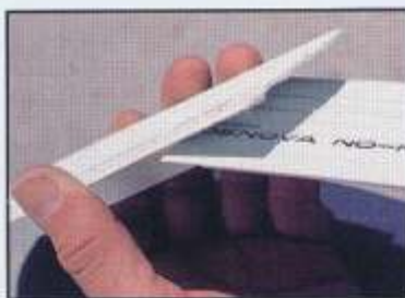
Photo 3: Overlap the Drip Edge 1" to allow for expansion and contraction.