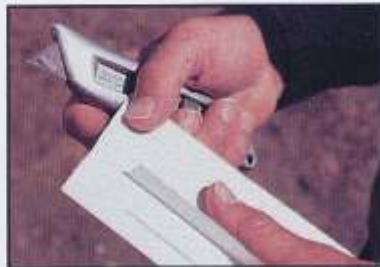
Photo 2: Carefully remove a 2½" piece of the drip lip from the end of the same piece of Drip Edge, using a utility knife.